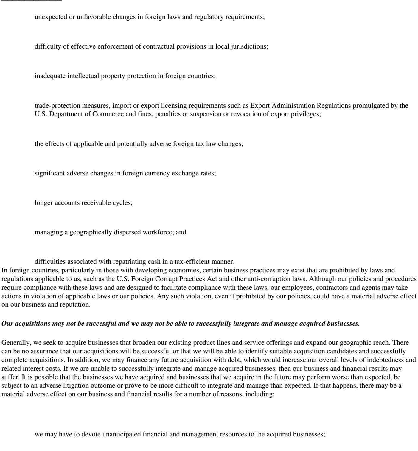
Table of Contents 31

we may not be able to realize expected operating efficiencies or product integration benefits from our acquisitions;